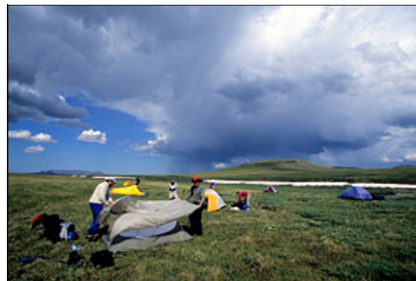
SANE ASYLUM: Camping at the Arctic National Wildlife Refuge.

You've heard it all before, but really, this could be your last chance to see the much debated 1002 area of the Arctic National Wildlife Refuge (ANWR) in its current state. Since the 1980s the 1002 area has been a battleground between oil lobbyists and environmental groups. Petroleum companies claim the oil in the 1002 area would help reduce U.S. dependence on foreign petroleum, while the environmental lobby maintains that any development would destroy one of the most pristine pieces of Arctic tundra left in the U.S. and the calving ground of the 130,000 strong Porcupine caribou herd. At the moment, legislation is in the works to begin drilling in 1002, and most pundits think the chances of it passing are good.